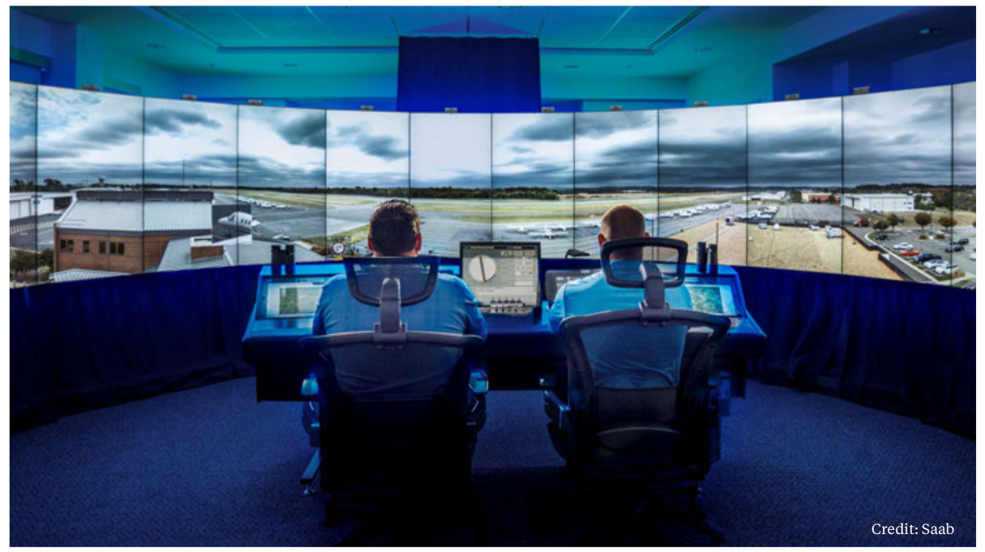
Remote tower system under test at Leesburg Executive Airport, Virginia

In Leesburg, Saab Sensis is employing a mobile tower from contract tower firm Robinson Aviation to operate side-by-side with the latest version of its European remote tower (in use in Ireland and Sweden). Passive testing took place in autumn 2016 with active testing scheduled for summer 2017. The project's goals include reducing arrival and departure delays for IFR traffic, providing greater safety margins for VFR traffic, and securing FAA certification for basic VFR tower services provided via a remote tower.