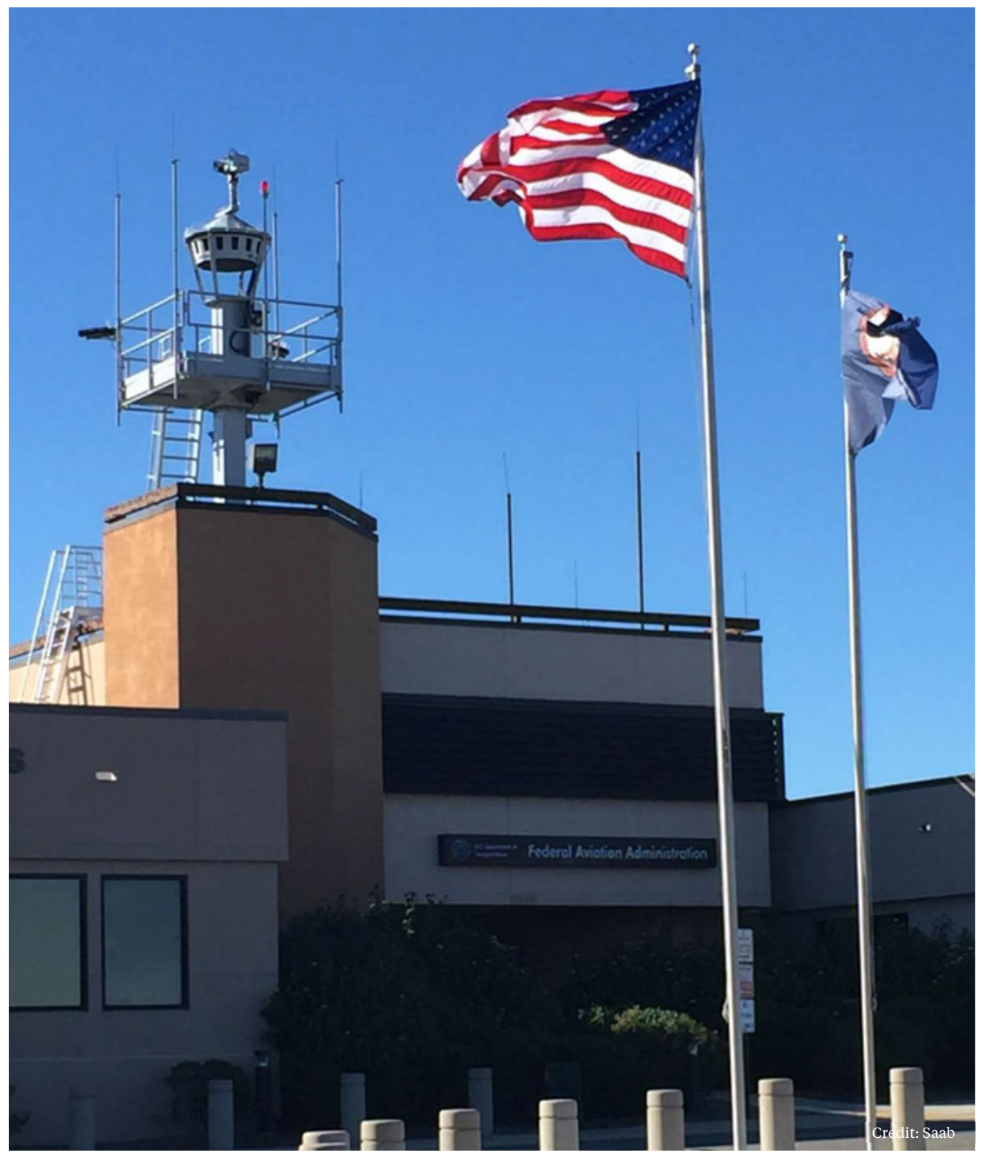
Remote tower camera housing deployed on the terminal building at the Leesburg Executive Airport, Virginia