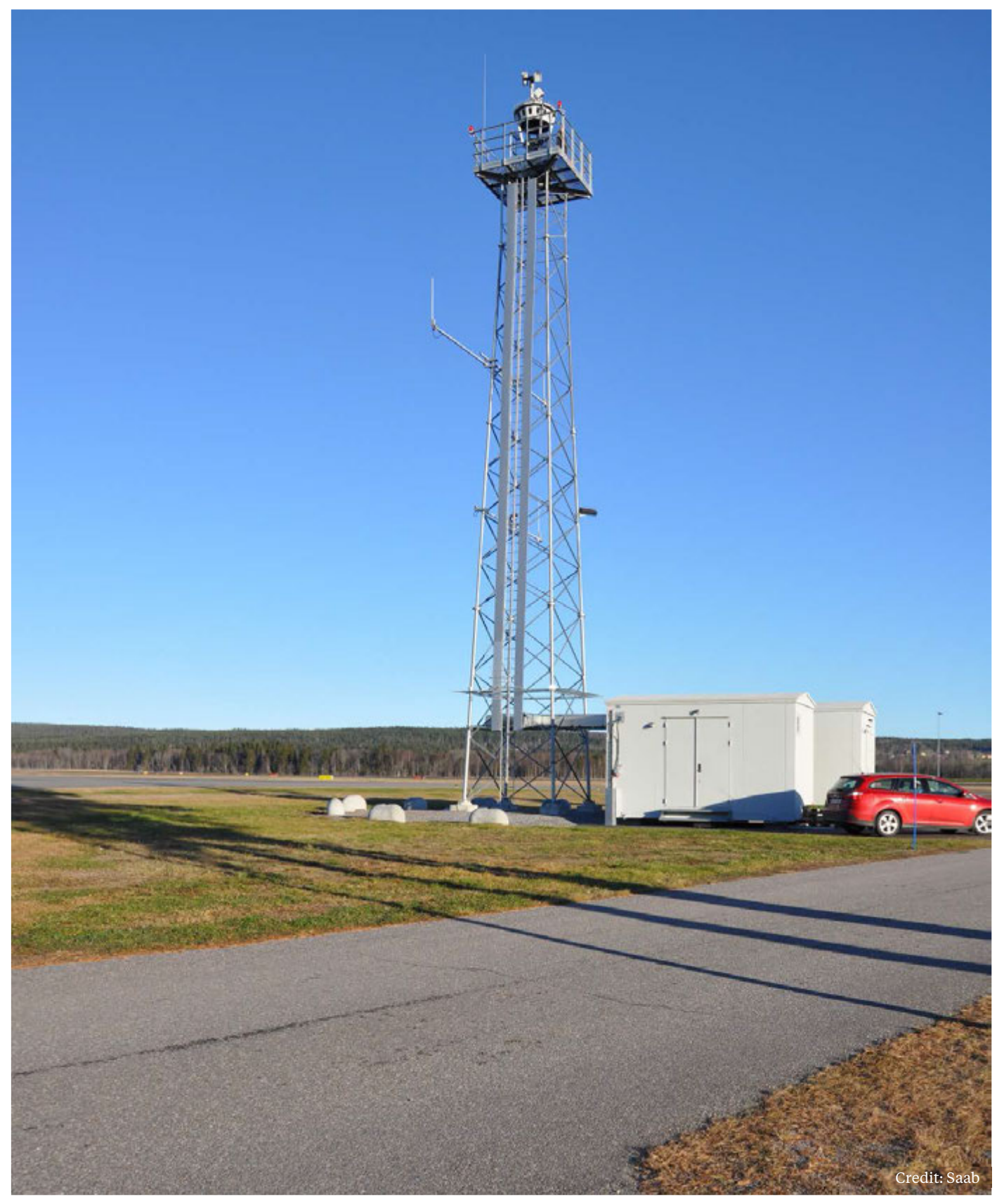
Remote tower camera housing deployed at the commercially-served Sundsvall-Timrå Airport in Sweden.