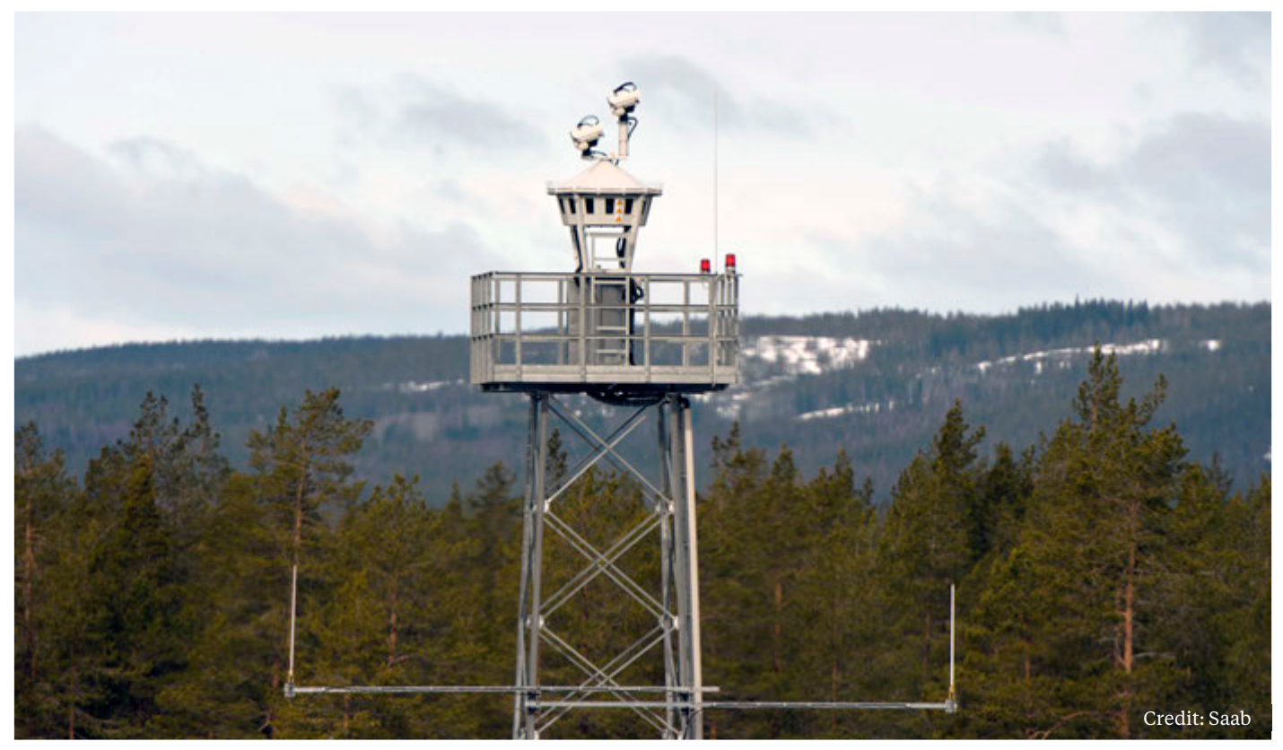
Remote tower camera housing deployed at the commercially served Ornskoldsvik Airport in Sweden.

After tests in conjunction with the European Research and Development Programme proved successful, in 2015, Avinor partnered with Kongsberg Defense Systems, using camera and radar technologies to operate remote air traffic control services from Bodø, a centralized facility adjoining an existing airport. Avinor serves 46 airports and in 2017 will commission and begin providing remote services at five airports, toward a goal of operating 15 remote towers by 2020. The total capital expenditure budgeted for the remote tower project between 2015 and 2020 was €81.7 million ($87.6 million).<sup>14</sup>