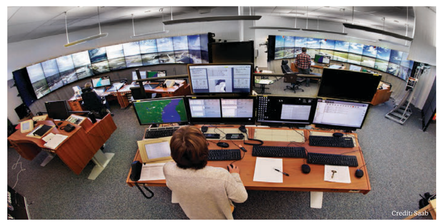
Controllers at LFV's Remote Tower Centre at Sundsvall shown providing remote tower services for the Örnsköldsvik and Sundsvall-Timrå Airports

Following Sweden, Norway provides another example where the cost of providing towered services encouraged the ATC provider to look at remote towers as an alternative. Both nations lie entirely north of the continental U.S. and, like Alaska, span northward beyond the Arctic Circle. Accessibility of aviation services is vital, yet relatively expensive given the weather conditions and the limited number of passengers and operations to spread the costs over. In addition, any airport in Sweden or Norway that accepts commercial airline traffic must provide towered, or now remote-towered services. That is a key difference from the United States, where commercial airlines routinely operate at non-towered facilities