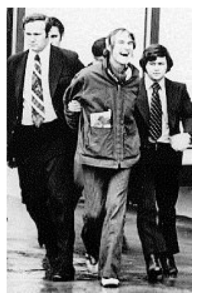
Leary arrested in 1972.

In response, Congress passed the Controlled Substance Act of 1970, outlawing drugs in all states. This Act explicitly named and scheduled all illegal drugs and provided for a system of penalties and enforcement that still stands today. Although the federal government surrendered its power to tax drugs, states seized the opportunity—with help from judicial precedent—beginning first with Arizona in 1982.<sup>9</sup>