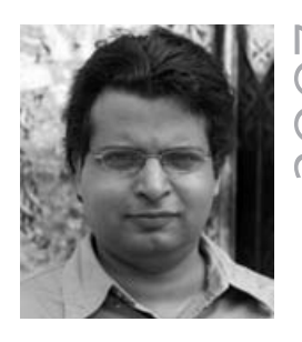
Amit Varma India For opinion columns written in Mint , an affiliate of the Wall Street Journal